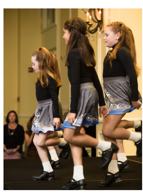
Dancers from the Boston Academy of Irish Dance impress and entertain our gala guests.