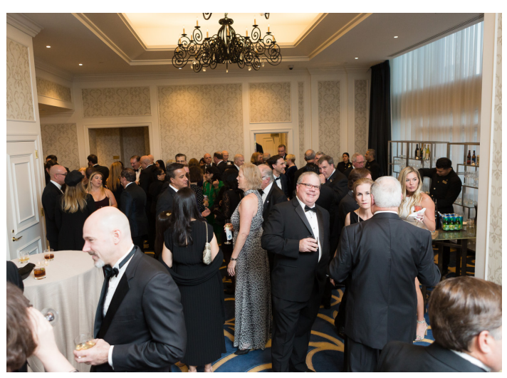
Guests mingle at the Boston Harbor Hotel during cocktail hour before the gala reception begins.