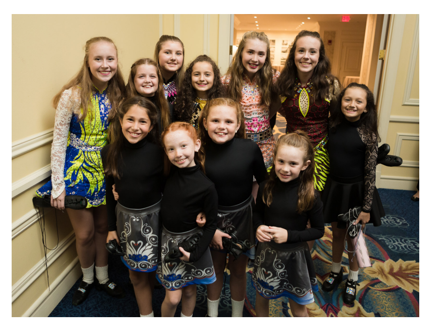
The girls from the Boston Academy of Irish Dance are all smiles before taking the stage.