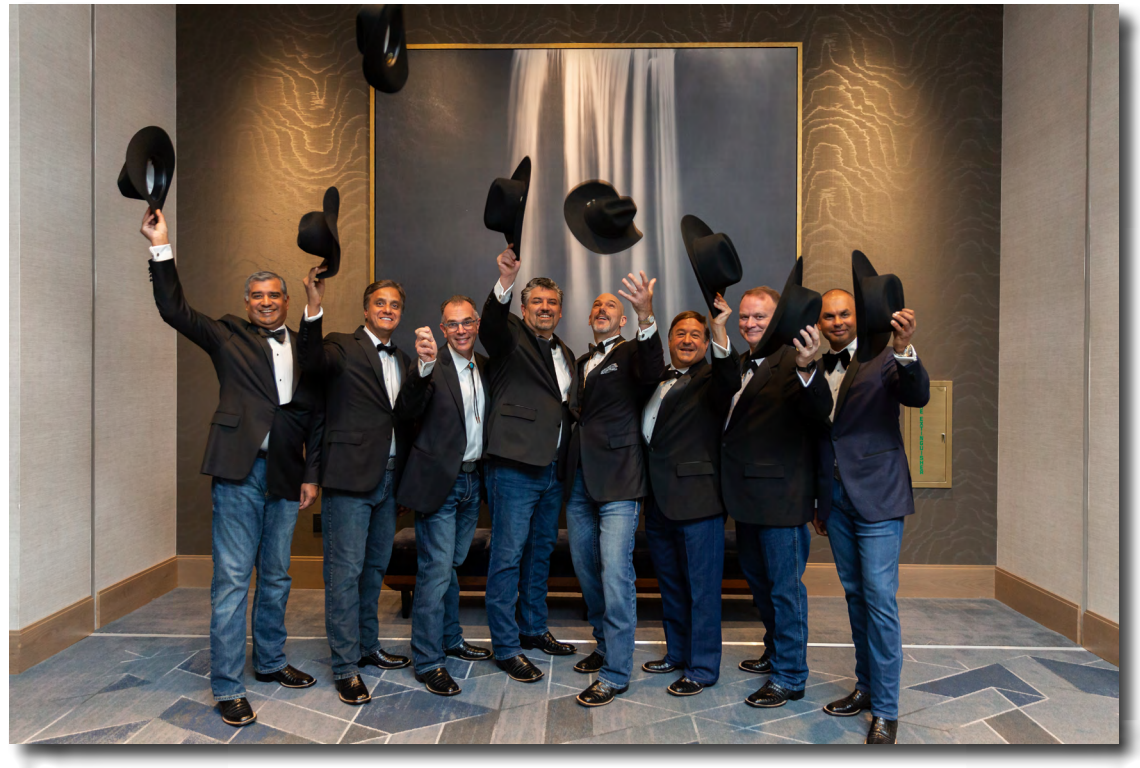
"Hats Off" to another great year!