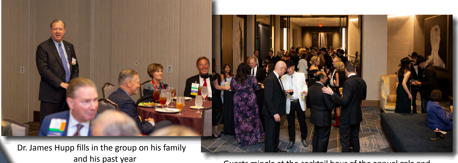
Guests mingle at the cocktail hour of the annual gala and dinner at the JW Marriott Nashville