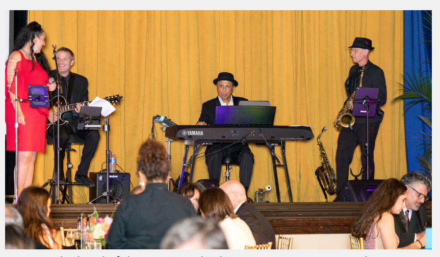
The band of the evening, Third Coast Jazz, prepares another song for entertaining the crowd during dinner.