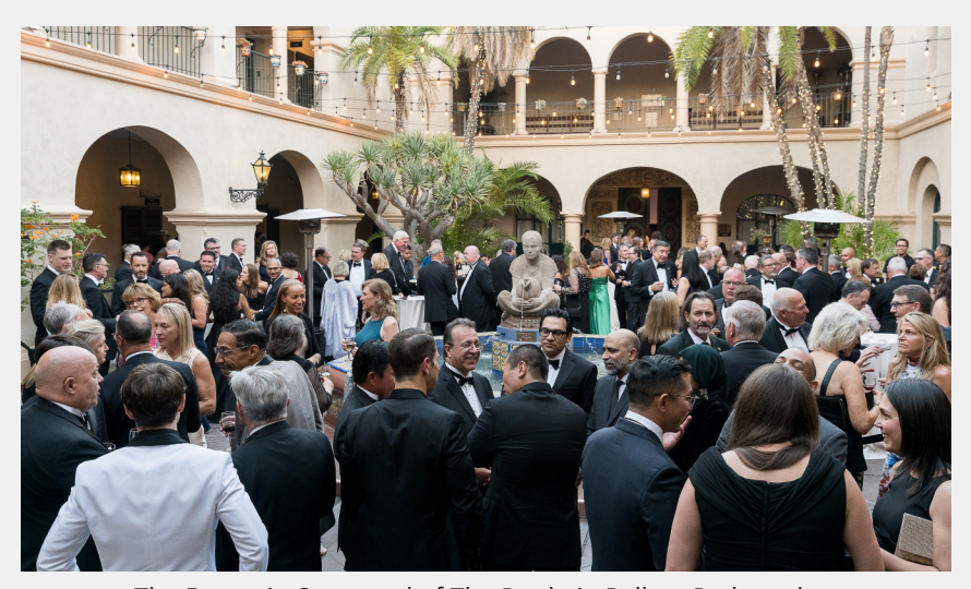
The Fountain Courtyard of The Prado in Balboa Park made a picturesque setting for guests to mingle during cocktail hour.